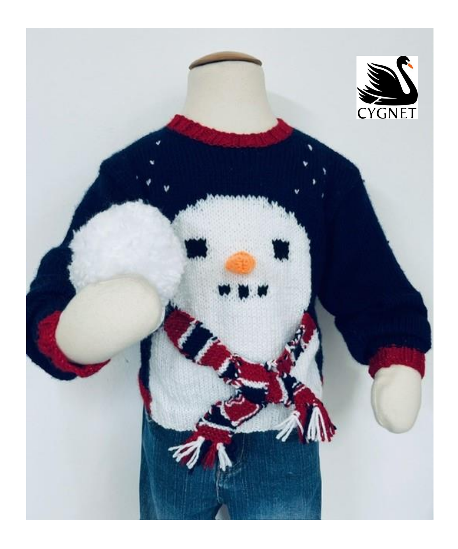
Cygnet Glittery DK Snowman Sweater CY1843