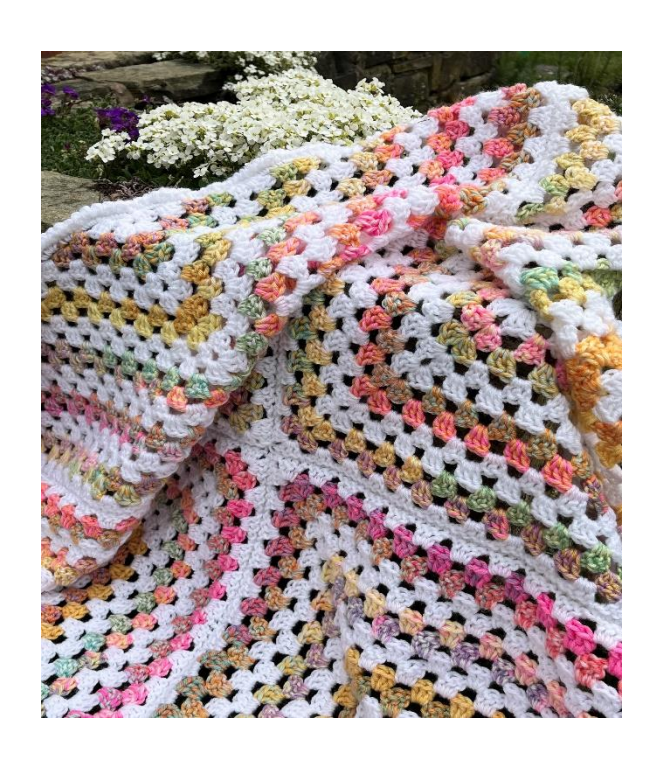
SPRINKLES POP AFGHAN BLANKET CY1884