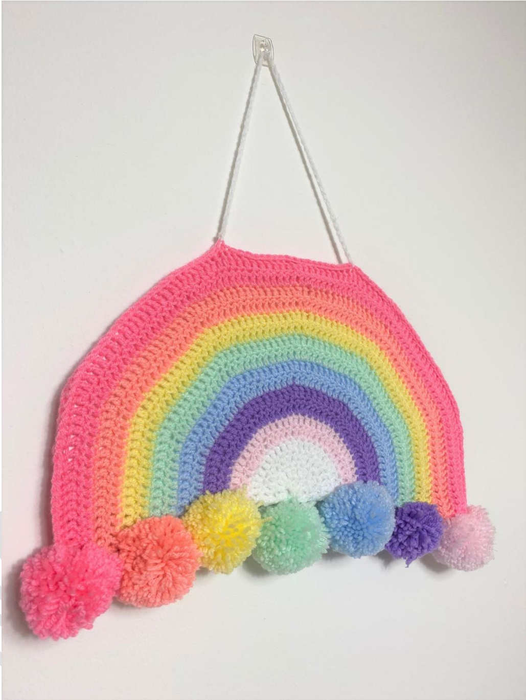
CY1506 LITTLE ONES DK PASTEL RAINBOW WALL HANGING