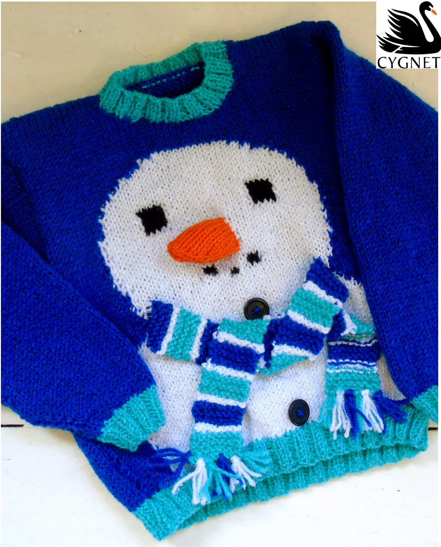
Cygnets Glittery DK Norman the Snowman Instarsia Sweater