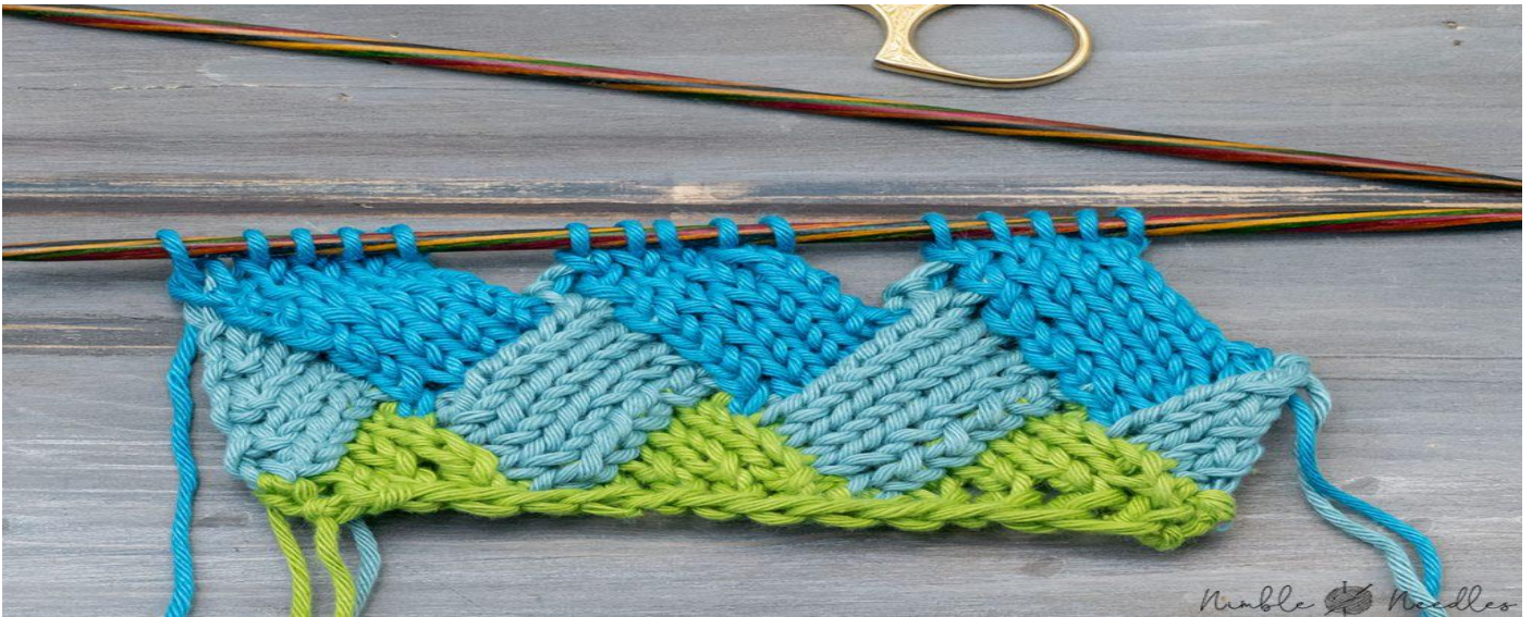
A row of left-leaning entrelac rectangles

From here, you can start knitting the third entrelac tier right away. And the good news is, you don't need any filler triangles on the edges and you can work from the right side (so much easier to pick up stitches).