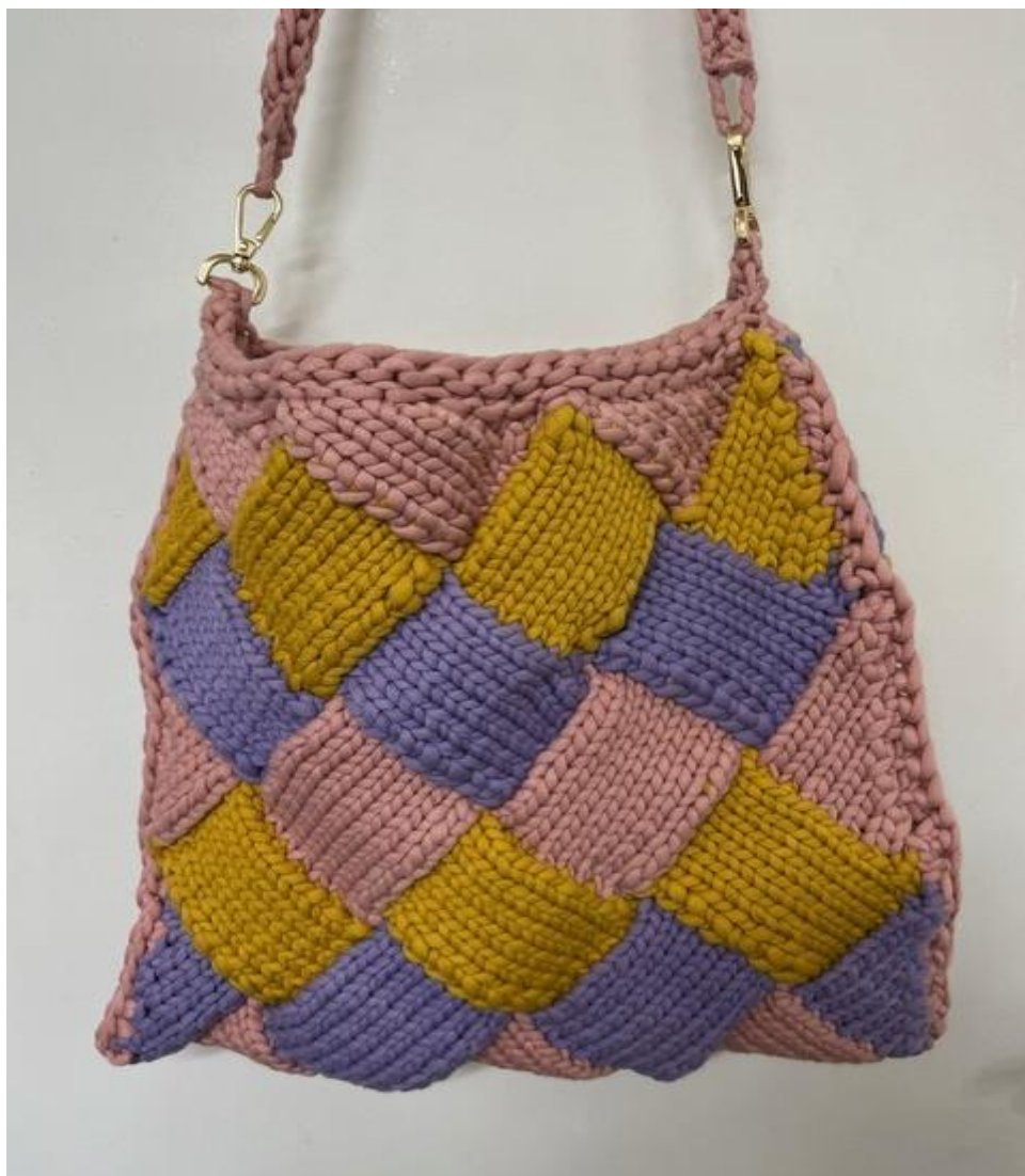
ENTRELAC BAG COTTON DROPS CY1823